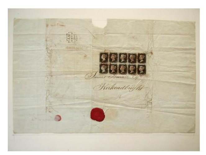
The famous Kirkcudbright" -cover, with a Penny Black block of 10 used on the 1<sup>st</sup> day of issue.