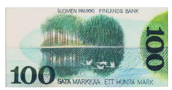
The Bruun -proof for 100mk note.

Another exceptional exhibit is the Exhibit of Proofs and Specimens of the Finnish Banknotes from the Bank of Finland Museum. Many of the rarities are now in public display for the first time.