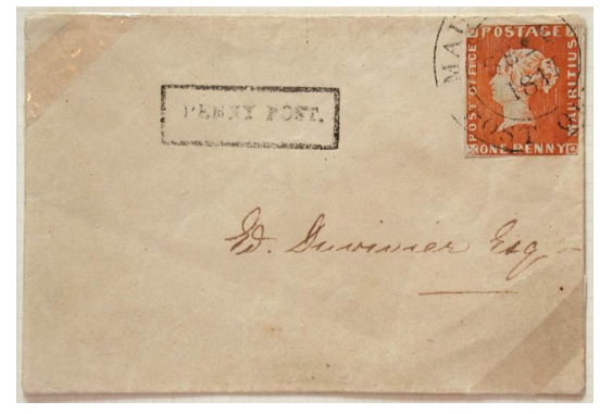
Mauritius One Penny Post Office stamp on cover

The exhibition will feature rare essays and proofs of the first stamps and postal stationery from 1839 to 1840. There will also be some 'superstars of philately' such as the blue unused Two Pence Post Office Mauritius stamp from 1847 and Bermuda Postmaster Provisionals from 1848 to 1854. The most notable among the later acquisitions is the Kirkcudbright Penny Black First Day cover. It bears ten Penny Blacks, the largest known group of Penny Blacks on a First Day cover.